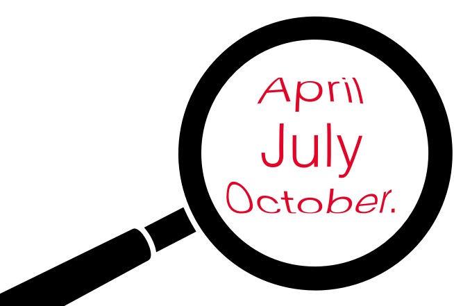
Funding Line increases 2014 - 2015

While the need to bolster cash flow can occur at any time, our lending data from the past two years shows that demand for invoice finance is highest in April, July and October.